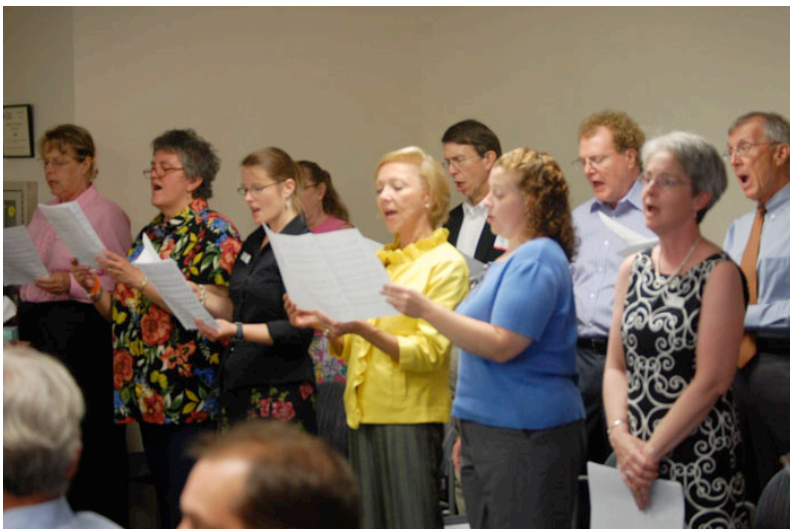
St. Augustine said, "when you sing you pray twice." TFCE Choir members offer their music to God and help to lead worship.

For 2011, my wish is to be able to establish a budget to: (1) hire a bass/baritone section leader as a steady presence to enhance our Sunday service music and (2) purchase initial choral music scores. Our choir has such devoted members who contribute greatly in both their time and talents! We are fortunate to be blessed with them.