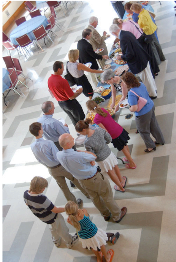
“Welcome all visitors as Christ himself.” Hospitality is one of our callings. Here, TFCE members share in fellowship during coffee hour.