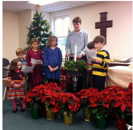
During our Christmas Pageant, children help to lead worship.

Outreach: In 2010, outreach was an important part of my overall ministry. Outreach is near and dear to my heart and to my personal sense of calling. Throughout Jesus' life and teachings we repeatedly see that God expects us as his children to respond assertively care reaching out to those in need. In my ministry during 2010 outreach, the form of " faith in action " was integrated into the curriculum and program planning for Christian education/formation with children and youth, including: