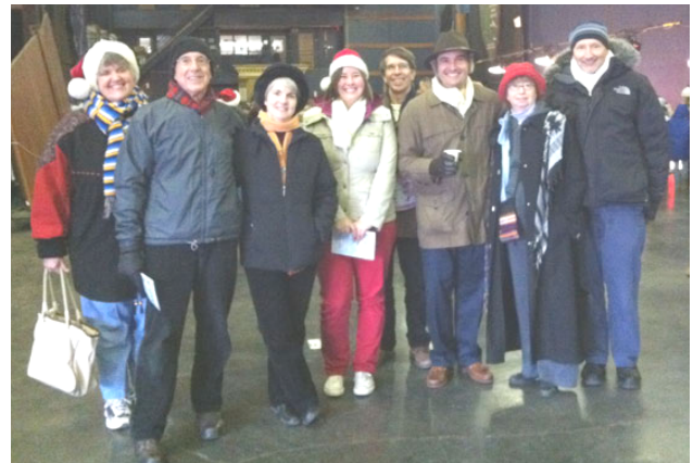
Members of TFCE's Choir at the Holiday Sing-Along

Throughout the year, we gladly incorporated singers from around the globe whilst they were visiting our church. Please keep your ears open for any possible new recruits—including high-schoolers!