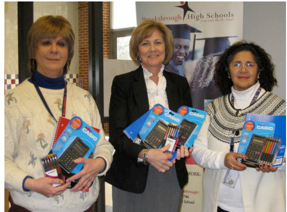
Sharing the blessings that we have received is what outreach is all about. Here, J.E.B. High School Principal and staff receive school supplies donated by TFCE parishioners.