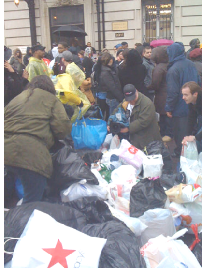
Following the devastating earthquake in Haiti, TFCE parishioners donated several carloads of emergency supplies to the Haitian Embassy.

Thanks to everyone for your generous and loving donations of time, talent, and needed items. May we all continue not only to be blessed but to share those blessings with others.